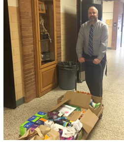
FOOD & PERSONAL CARE ITEMS DELIVERED TO FAIRVIEW MS & HS