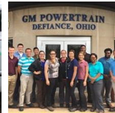
GM DEFIANCE INTERN COOKOUT