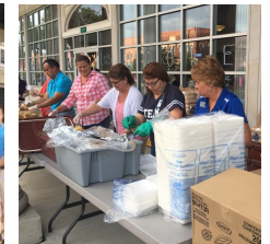
FIRST FEDERAL CHICKEN DINNER