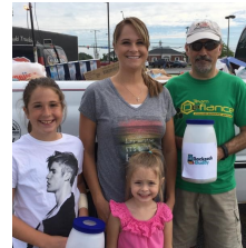
BACKPACK BUDDY LIVE DRIVE

Leadership giving (gifts at or above $500) increased 32%!